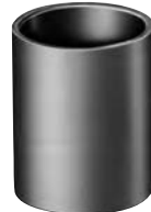
Socket type for joining non-metallic conduit.

All socket fittings should be attached using Carlton® solvent cement.